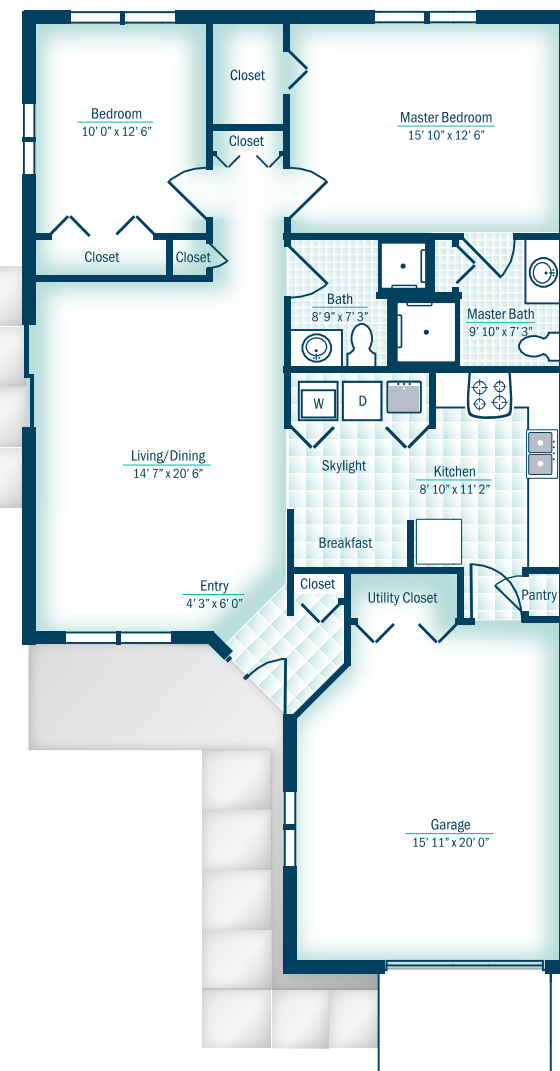
Twin Cottage With Patio 1,155 Sq. Ft.