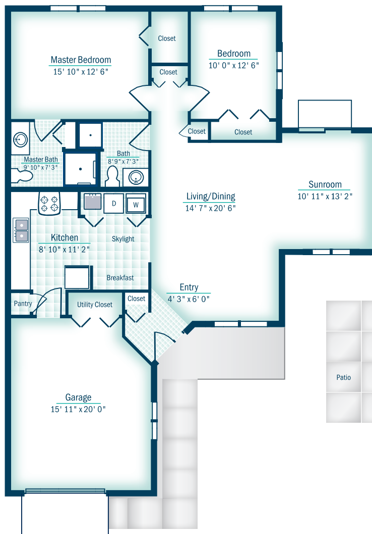
Twin Cottage With Enclosed Sunroom 1,309 Sq. Ft.