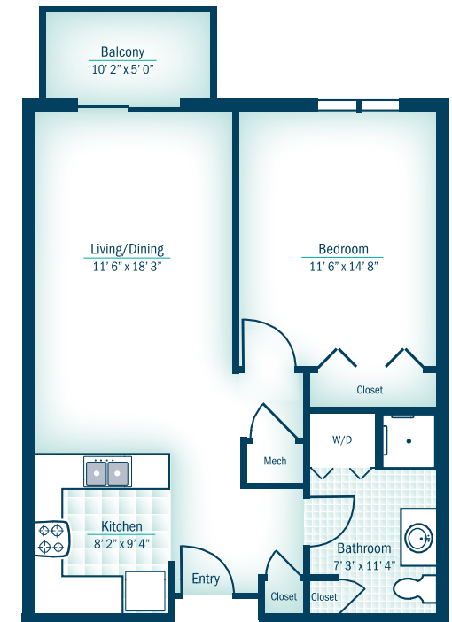
One-Bedroom Apartment 731 Sq. Ft.